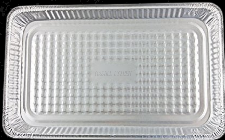
Standard Full Sized Pan- 20x12 inches